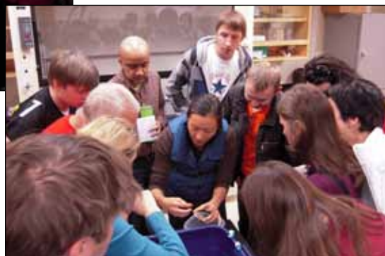
Top: Participants learn about the water chemistry of Pyramid Lake, the terminus of the Tahoe-Truckee Watershed. Bottom: Researchers at the Desert Research Institute in Las Vegas teach participants about invasive zebra mussels, which are a serious management issue at Lake Mead.

The Tahoe-Baikal Institute now has strong new contacts with three Russian scientific institutes with which we had not worked in the past, and we will be able to correspond with these new partners about other ideas and program opportunities over the upcoming months and years. This program, sponsored by USAID's FORECAST program, was an extremely important opportunity for our small organization to expand our programming and reach out to new partners in both the US and Russia.