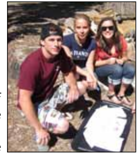
TBI's Summer Exchange Participants build a watershed model.