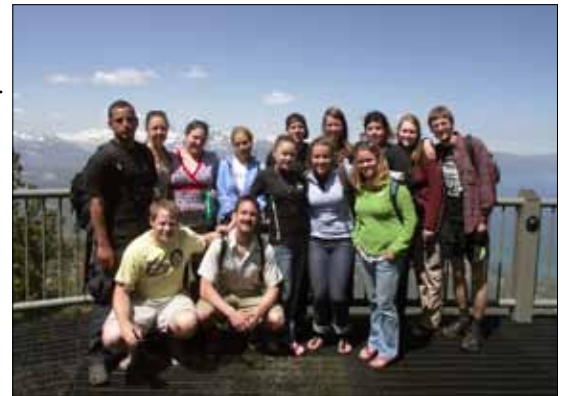
2011 Summer Environmental Exchange group overlooking the Tahoe watershed.

Program Summary: In early June, TBI hosted a weekend "retreat" program at Fallen Leaf Lake for Mongolian teens from the Sacramento area, as well as their families. The goal of the program was to allow the youth, who are currently living in an urbanized area, to connect with nature. TBI's staff facilitators employed multiple activities taken from Project WET and Nature's Classroom conservation and environmental education curricula to teach the group about the ecosystem at Fallen Leaf Lake. Additional activities allowed the group to explore possible career paths within the field of Natural Resource Management. The participating students, as well as their entire families, received a better understanding of the environment and the challenges to protection and restoration of Lake Tahoe and other cherished ecosystems; they experienced Taylor Creek and the first annual "Wild Tahoe Weekend", showcasing Tahoe's native flora and fauna, and they also experienced "camping out" with a traditional Mongolian fireside meal and recreational activities along the shoreline of Fallen Leaf Lake. The program was thoroughly enjoyed by all staff, board members and participants involved.