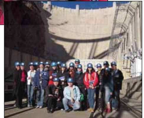
Top: Participants learn about the Lahontan Cutthroat Trout at the Paiute Tribe's fish hatchery near Pyramid Lake. Bottom: Group in front of the Hoover Dam, after a detailed tour of its inner workings.