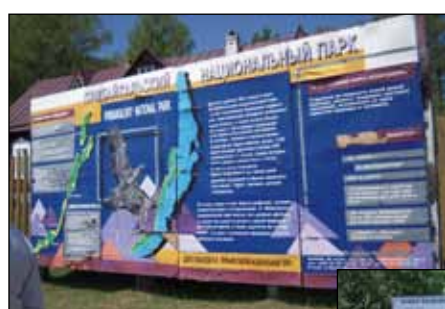
The delegation studied existing visitor signs and made suggestions for possible improvements.