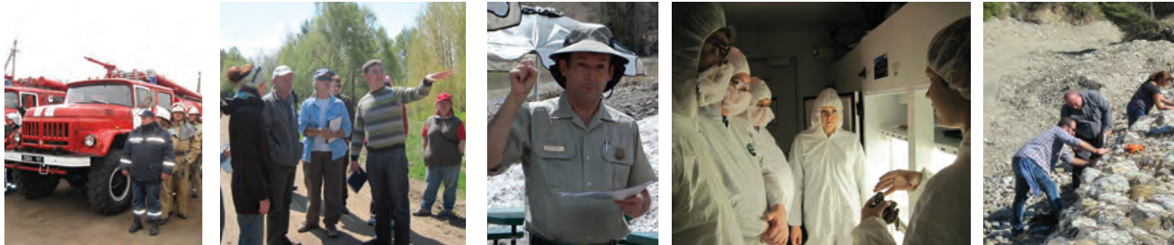
Photos from left to right: Collaborative fire fighting training in Ukraine; USFS recreation specialists provide on-site consultation at a popular National Park in Russia; USFS ranger explains concession management; Russian foresters learn about invasive pest management at a USFS laboratory in Michigan; field exercises at a USFS led watershed management training workshop in Georgia.

US Forest Service (USFS) International Programs uses a variety of methods and various types of programs to achieve our work. We bring groups of natural resources managers to the US to see current practices first hand, and we also bring our USFS employees overseas to work on-site with local partners, doing specialized consultations or large group trainings. We adjust our program activities to most effectively reach the target audience and provide the most valuable learning experience for the participants.